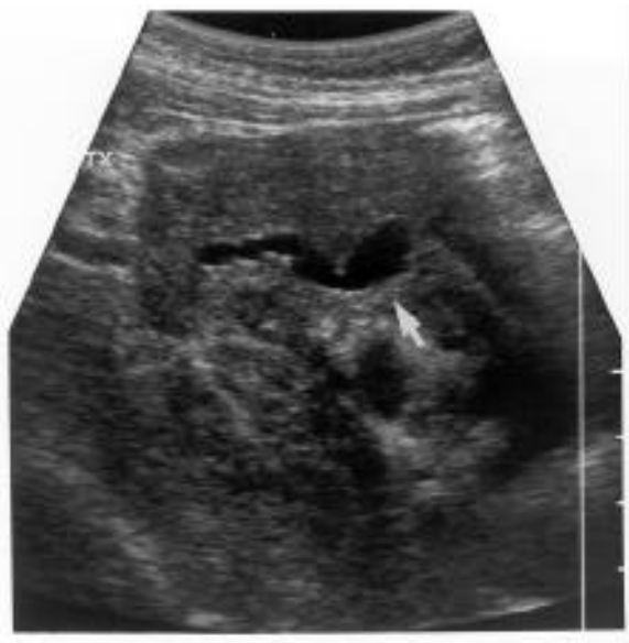
Figure 1. Ultrasound evaluation showed the pancreas transplanted in the right iliac fossa. A tubular structure was identified within the transplanted pancreas, which likely represented a dilated pancreatic duct. This structure measured 10.3 mm in transverse dimension.