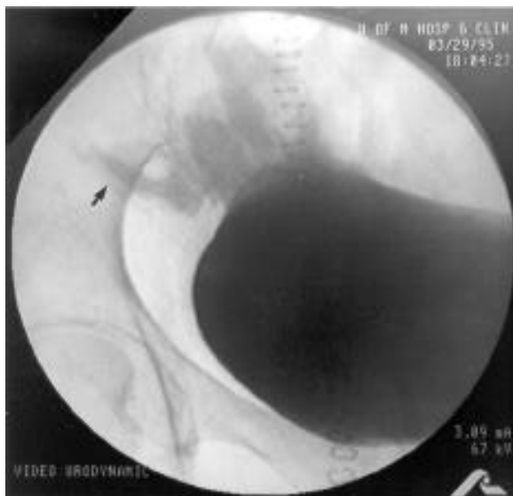
Figure 2. During the video-urodynamics, the patient was on supine position and monitored fluoroscopically. The bladder was filled with dilute contrast. Fluoroscopic control revealed a smooth walled bladder during the filling phase with a closed bladder neck. The patient experienced some reflux of urine into the duodenum segment and into the pancreatic duct during the height of the filling phase

and especially during the voiding phase.